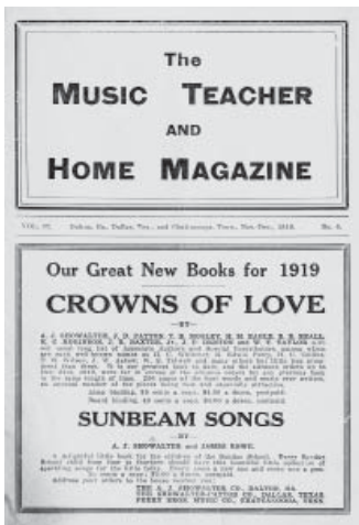
1919 title page from The Music Teacher and Home Magazine