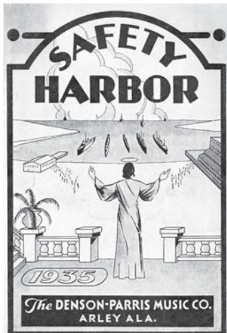
ABOVE: Safety Harbor cover from Denson-Parris Music Company

The beginnings of “shapenote” singing in Alabama are essentially rooted in early British singing-school practices that were transferred to New England colonies in the 1700s during the era of the Great Awakening in England that first embraced congregational hymn singing in church services. Singing schools and singing societies became an important element of America’s emerging musical education. In a singing school the student is taught to read and sing music from the printed page. He is also taught to sing each particular sound in a musical scale using syllables, called solfege, solfeggio, or solemization. Early English practices adopted the syllables fa, so, la, fa, so, la, mi, fa to complete an octave of a major scale. Note that only four syllables are used. Later, the