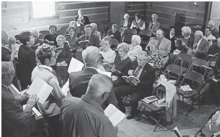
Singers at the Cullman County Convention

years ago might come back to get together with old friends and enjoy the good music and the good food. Or sometimes a community would make singing a regular monthly thing all summer long, moving from one church to another each Sunday, and choosing a different leader for every singing. The singings began to grow and become more and more organized. Sometimes two or three counties would get together for regular singings. They would elect officers, a president, secretary, and treasurer to handle the details... the county meetings grew into statewide conventions which attracted thousands to Birmingham and Nashville.