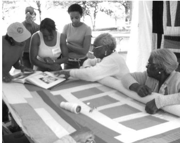
The Gee’s Bend Quilters will help Fort Payne celebrate the City’s “Boom Days” on Sept. 15.